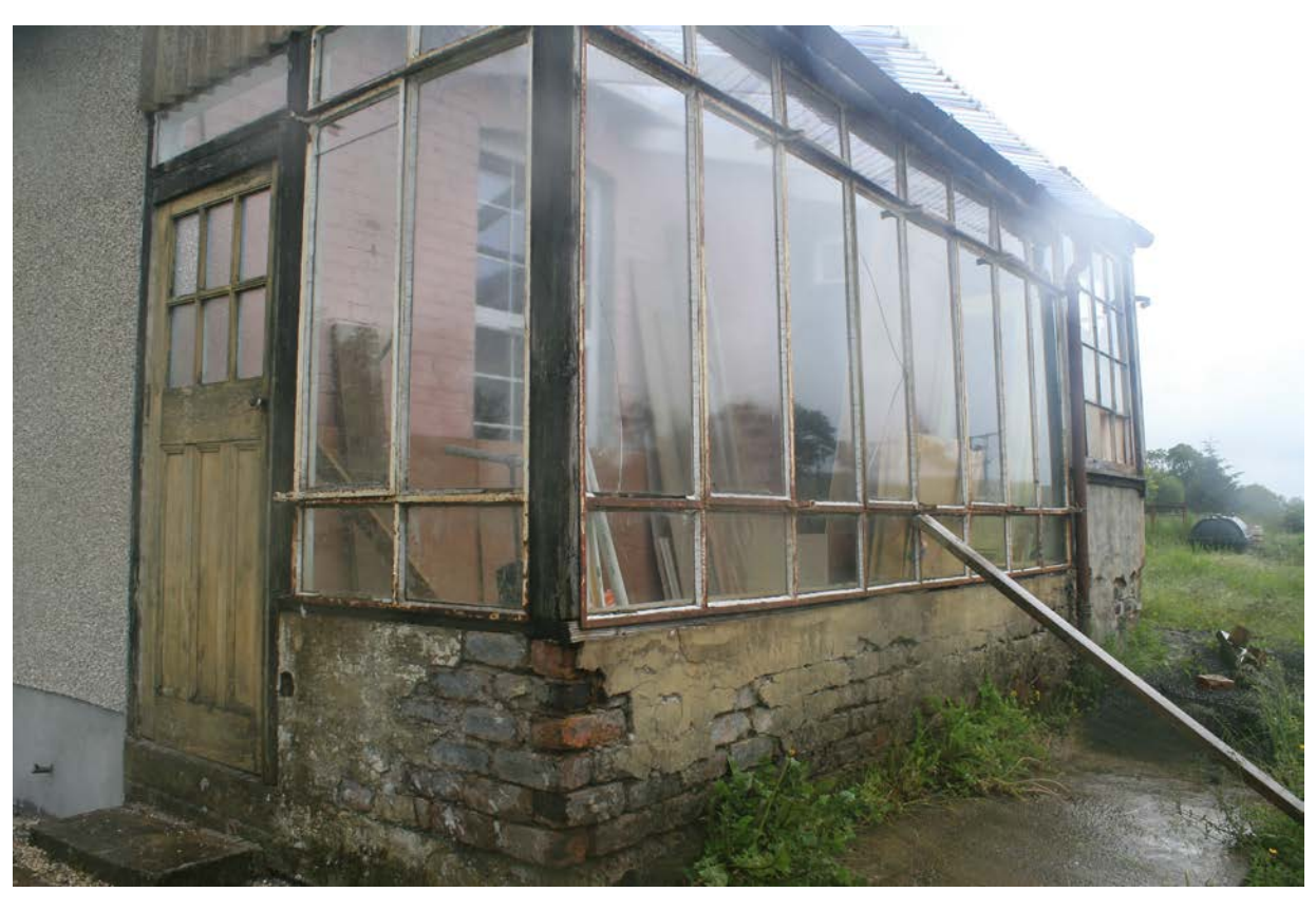
Property 22: Station House - The views looking north west here are fairly open and there is visibility of the site, but there is also some woodland nearby concealing some views.