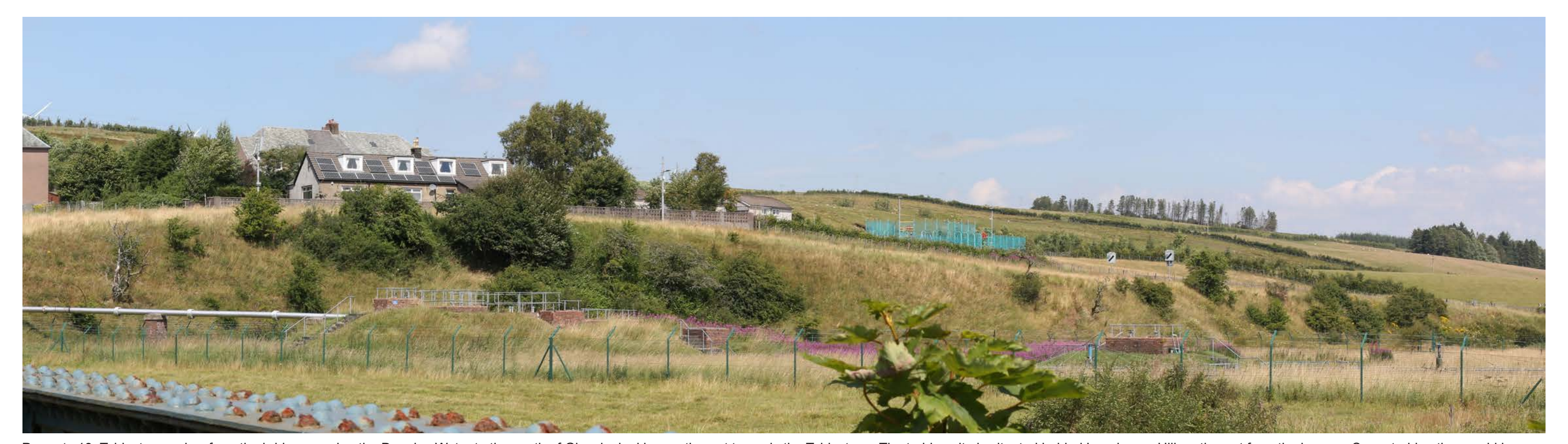
Property 18: Tablestane - view from the bridge crossing the Douglas Water to the south of Glespin, looking north west towards the Tablestane. The turbine site is situated behind Longhouse Hill north west from the houses. Some turbine tips would be seen above the hill to the north west.