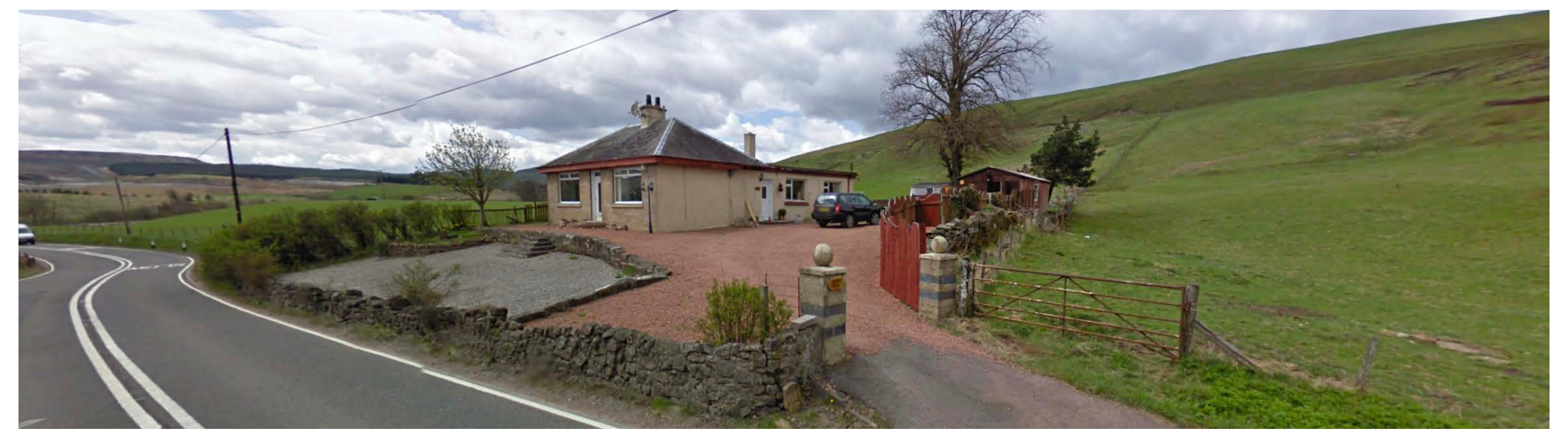
Property 12: Longhouse Cottage - View south west from the A70 towards Longhouse Cottage, turbine site located northwards from the A70. Turbines would not be visible from Longhouse Cottage due to Longhouse Hill.