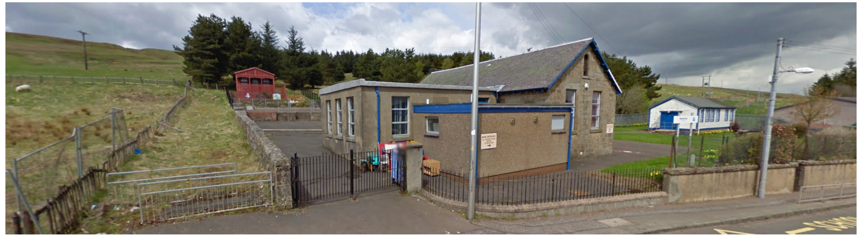
Property 15: Properties on Driverholm Terrace - Stablestone Primary School, one of the proposed wind farm from this location, six tips would be partially visible but additional screening is provided by trees behind the properties.