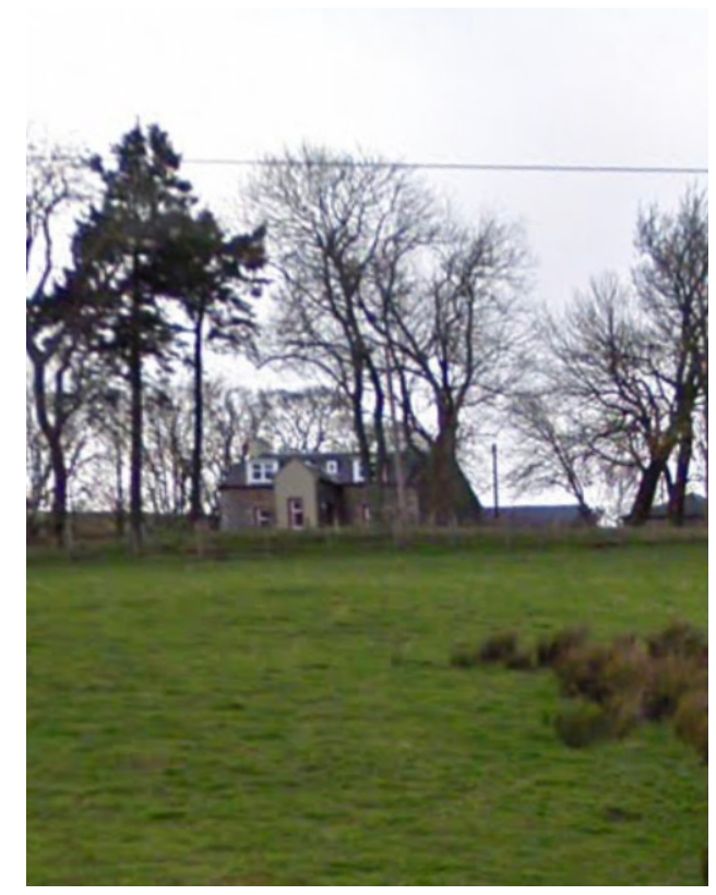
Property 2: Debog Farm - Views from the A70 looking northwards across to Debog Farm. The site lies to the north west, with the turbines mostly screened by Shiel Hill.