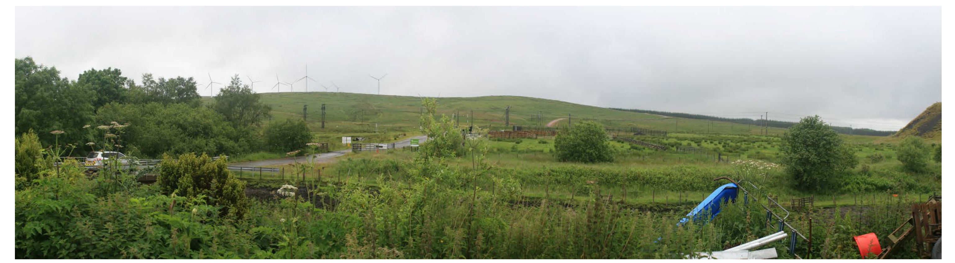
Property 23: Blackwood Cottage - The views looking north west are fairly open and there is visibility of the site from the property.