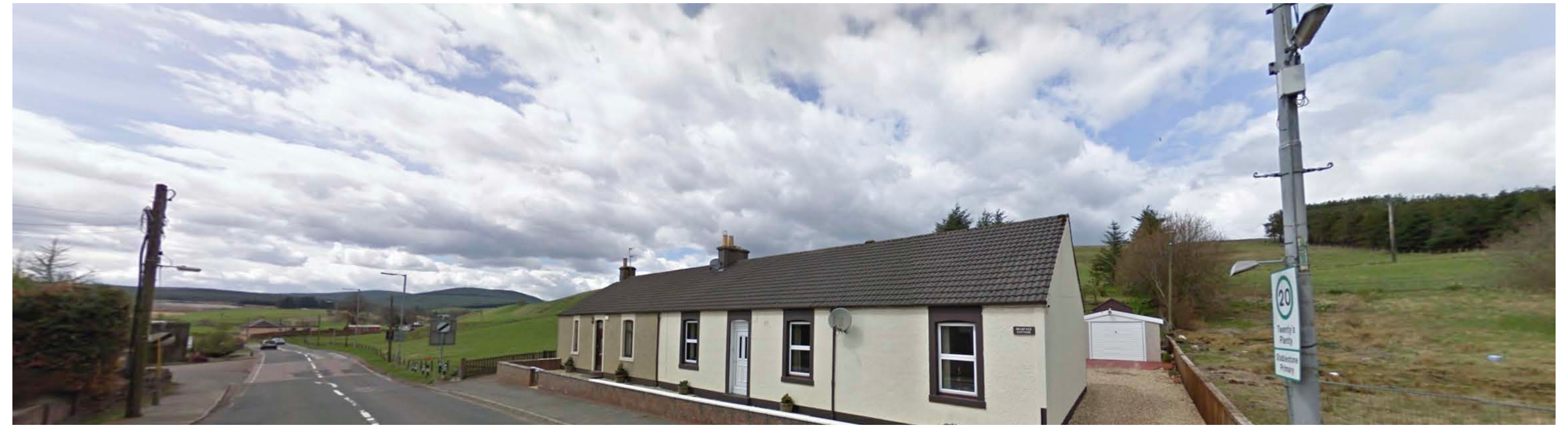
Property 13: 2 Breface Cottage (left) and property 14: 1 Breface Cottage (right) looking north west. Only the tips of 3-4 turbines would be visible in this location through vegetation in the back garden.