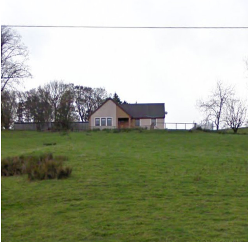
Property 3: Shielpark - Views from the A70 looking northwards across to Shiel Park The site lies to the north west, with the turbines mostly screened by Shiel Hill.