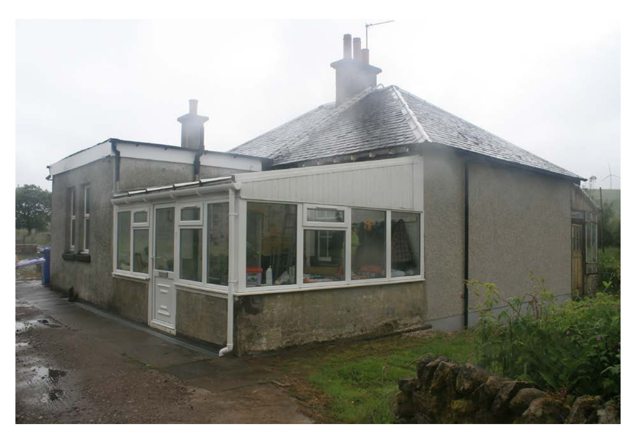
Property 22: Station House - looking north west. The views here are fairly open and there is visibility of the site, but there is also some woodland nearby concealing some views.