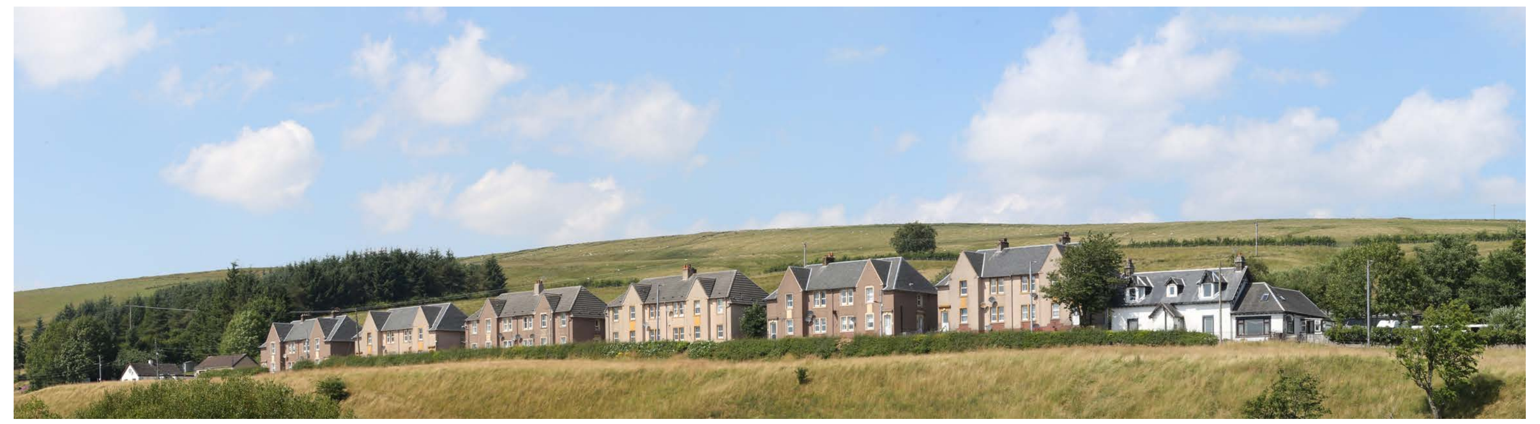
Property 16: Properties on Ayr Road from the bridge crossing the Douglas Water to the south of Glespin looking north west towards the Properties on Ayr Road. The turbine site is situated behind Longhouse Hill which is the hill behind the properties, northwards from the houses. This row of houses would see a only the very tips of turbines above the hill.