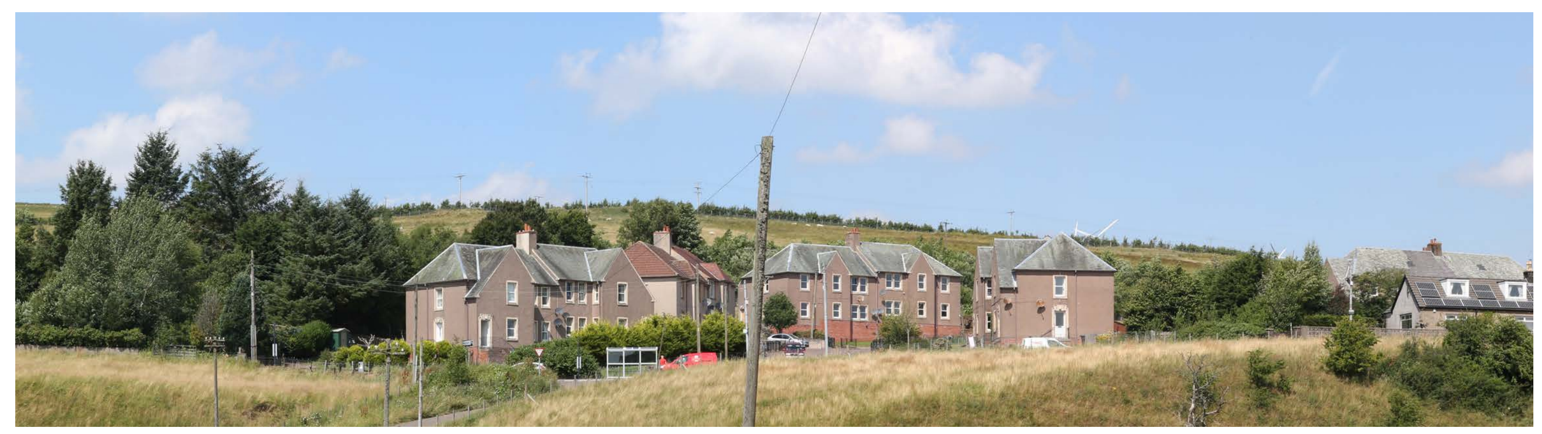
Property 16: Properties on Ayr Road and Property 18: Tablestane (right) from the bridge crossing the Douglas Water to the south of Glespin looking north west towards the Properties on Ayr Road. The turbine site is situated behind Longhouse Hill which is the hill behind the properties, northwards from the houses. This row of houses would see a only the very tips of turbines above the hill.