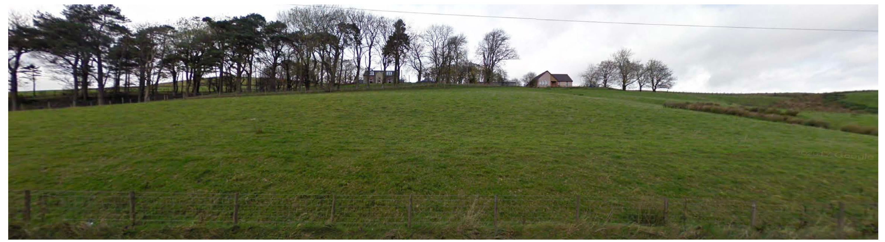
Property 2: Debog Farm and property 3: Shielpark - Views from the A70 looking northwards to Debog Farm to the left and Shielpark to the right of the picture. The site lies to the north west, with the turbines mostly screened by Shiel Hill.