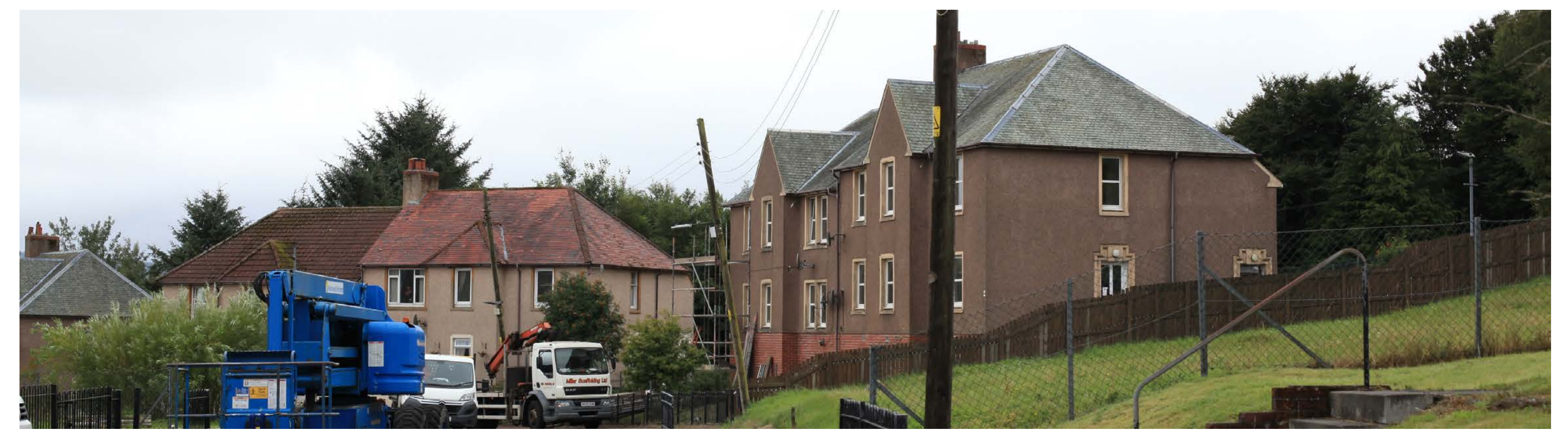
Property 17: Properties on Hillview Crescent - View towards housing in a south western direction. Turbine site location is to the rear of the properties in a northenly direction.