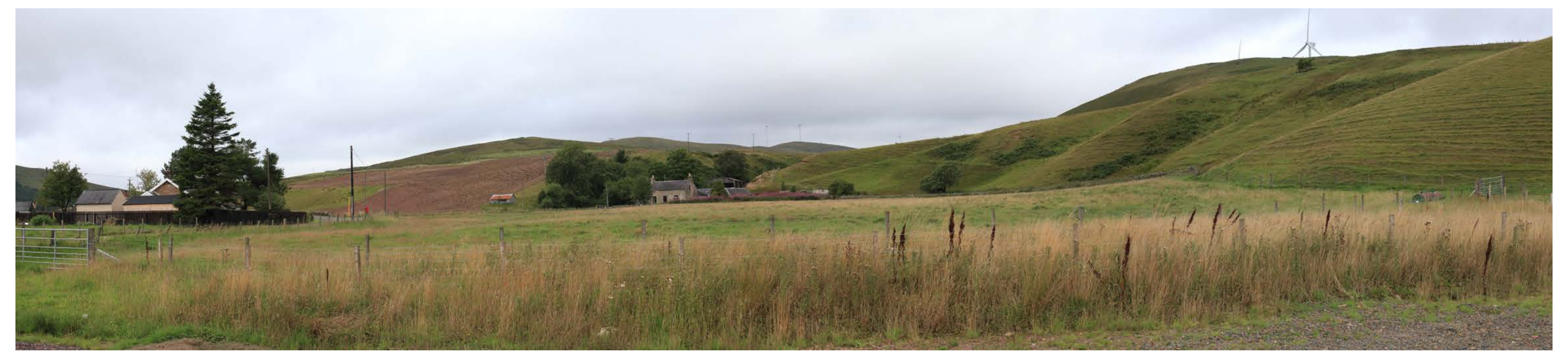
Property 4: Monksfoot and property 5: The Shieling and property 6: Inches Cottage - View from the property access road off the A70 looking north west to The Shieling and Inches Cottage. The site lies to the north and north west, with the turbines mostly screened by Strawberry Hill.