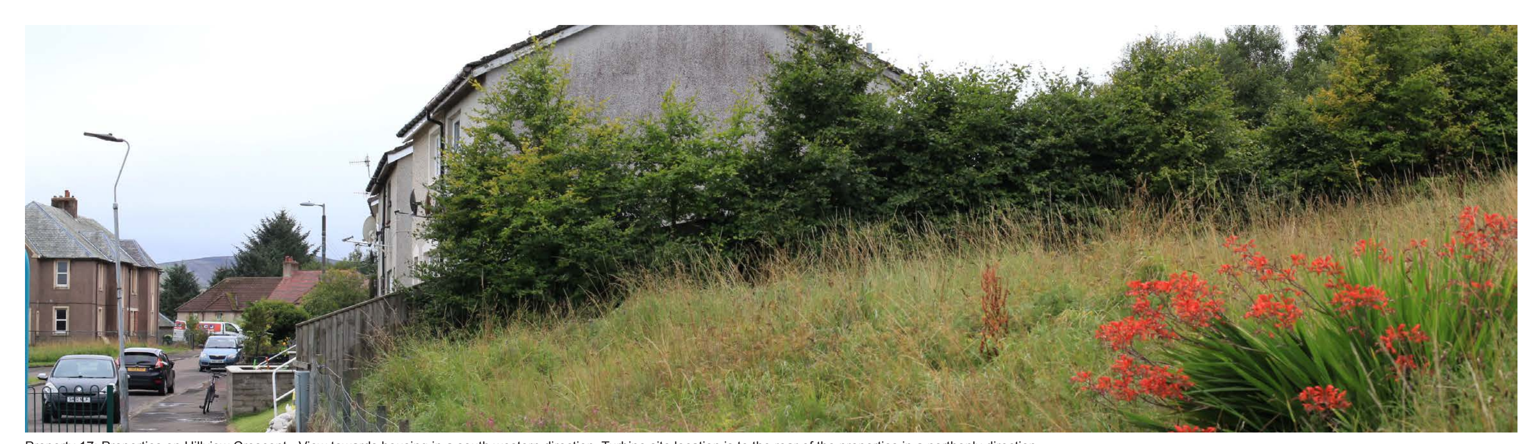
Property 17: Properties on Hillview Crescent - View towards housing in a south western direction. Turbine site location is to the rear of the properties in a northenly direction.