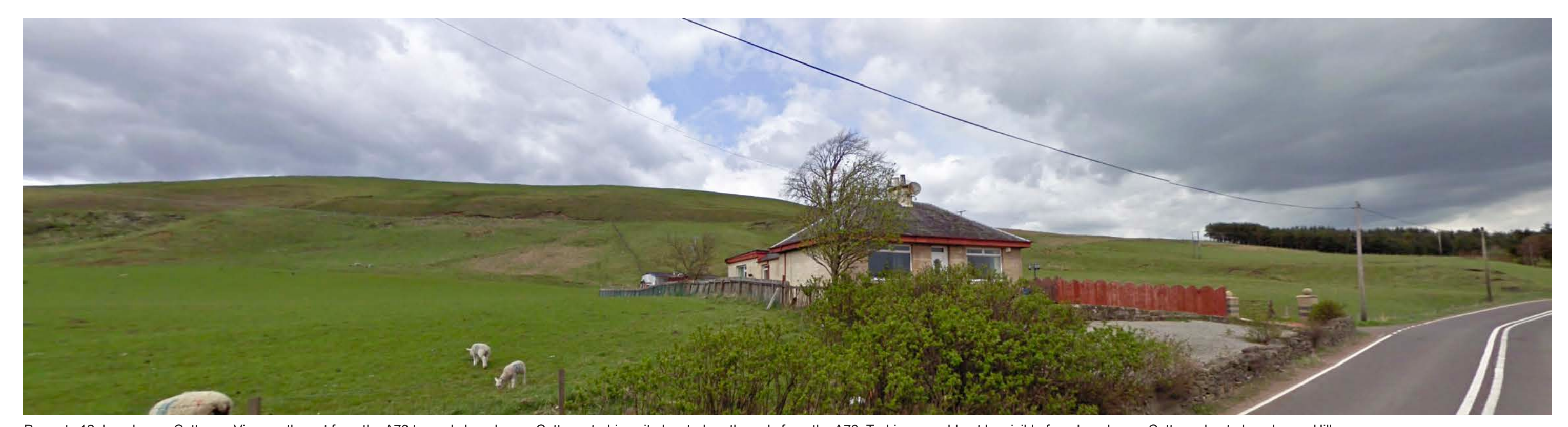
Property 12: Longhouse Cottage - View north east from the A70 towards Longhouse Cottage, turbine site located northwards from the A70. Turbines would not be visible from Longhouse Cottage due to Longhouse Hill.