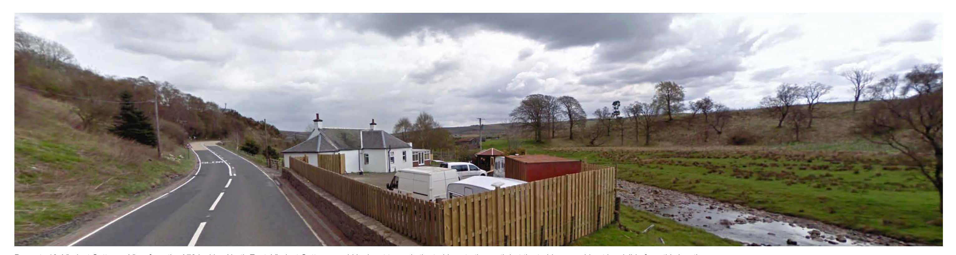
Property 10: Viaduct Cottage - View from the A70 looking North East, Viaduct Cottage would look out towards the turbines to the north but the turbines would not be visible form this location.