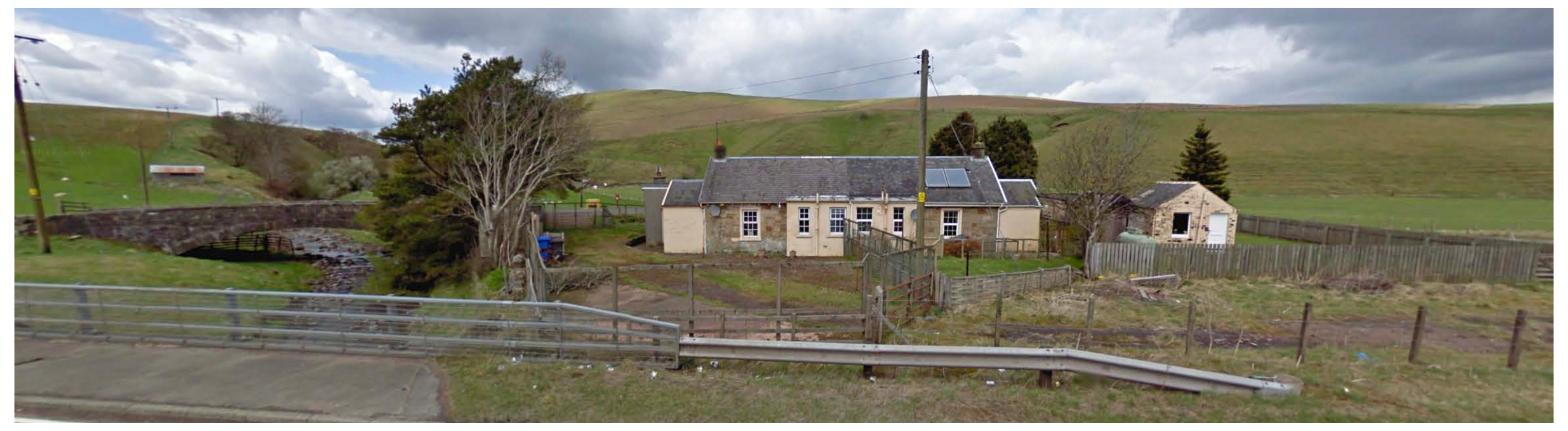
Property 5: The Shieling and property 6: Inches Cottage - View from the A70 looking northwards to The Shieling and Inches Cottage. The site lies to the north and north west, with the turbines mostly screened by Strawberry Hill and Arrarat Hill.