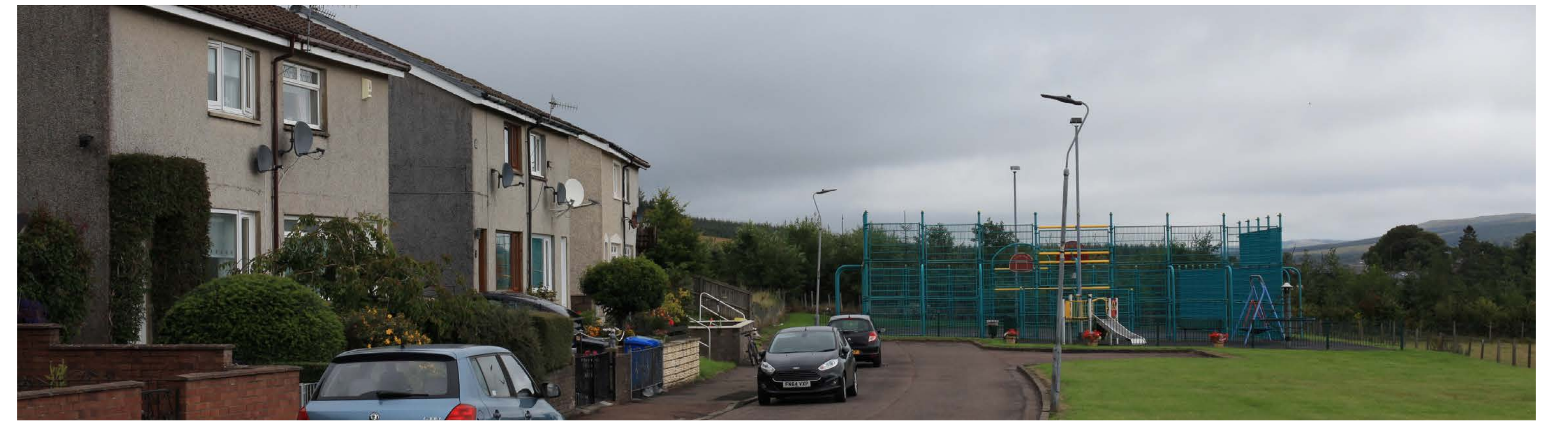
Property 17: Properties on Hillview Crescent - View towards housing and playground, looking north east. The turbine site is situated north west of the Properties on Hillview Crescent.