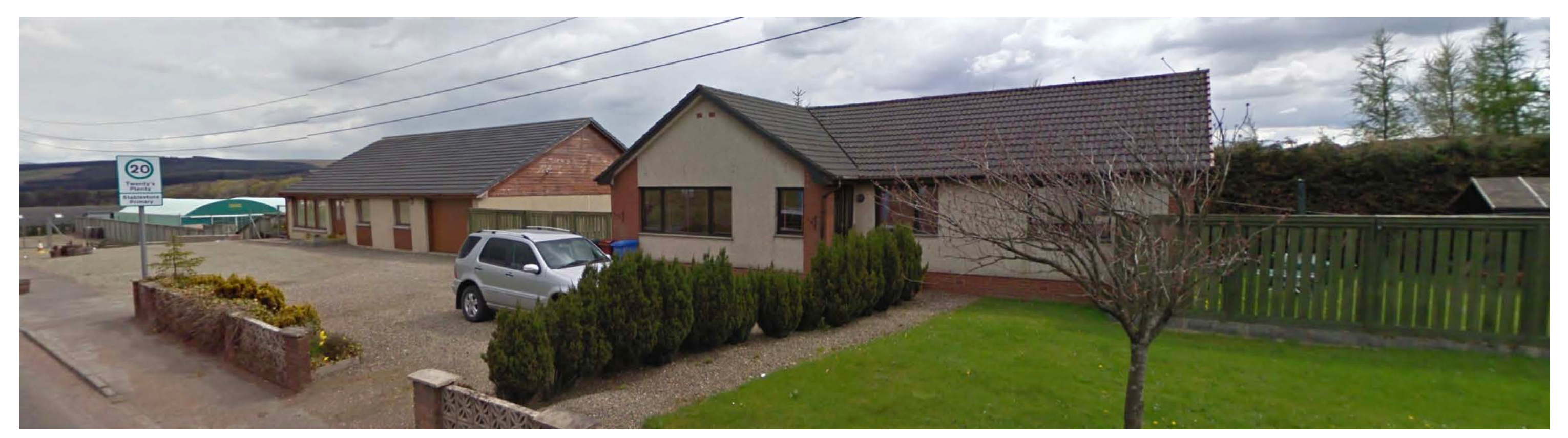
Property 15: Properties on Driverholm Terrace - One of the properties on Driverholm Terrace, view southwards of the property, there would be minimal visibility of the proposed wind farm northwards from the properties on the road.