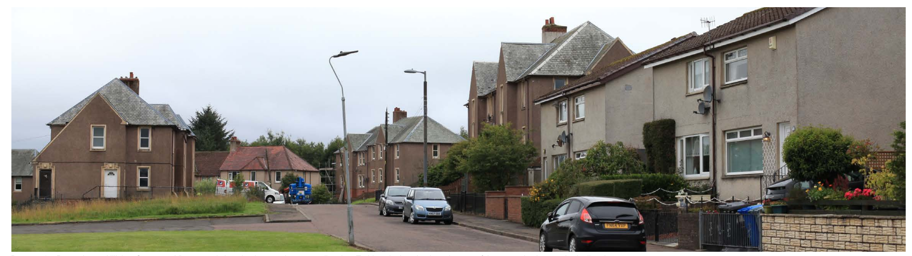
Property 17: Properties on Hillview Crescent - View towards housing in a south western direction. Turbine site location is to the rear of the properties in a northerly direction.