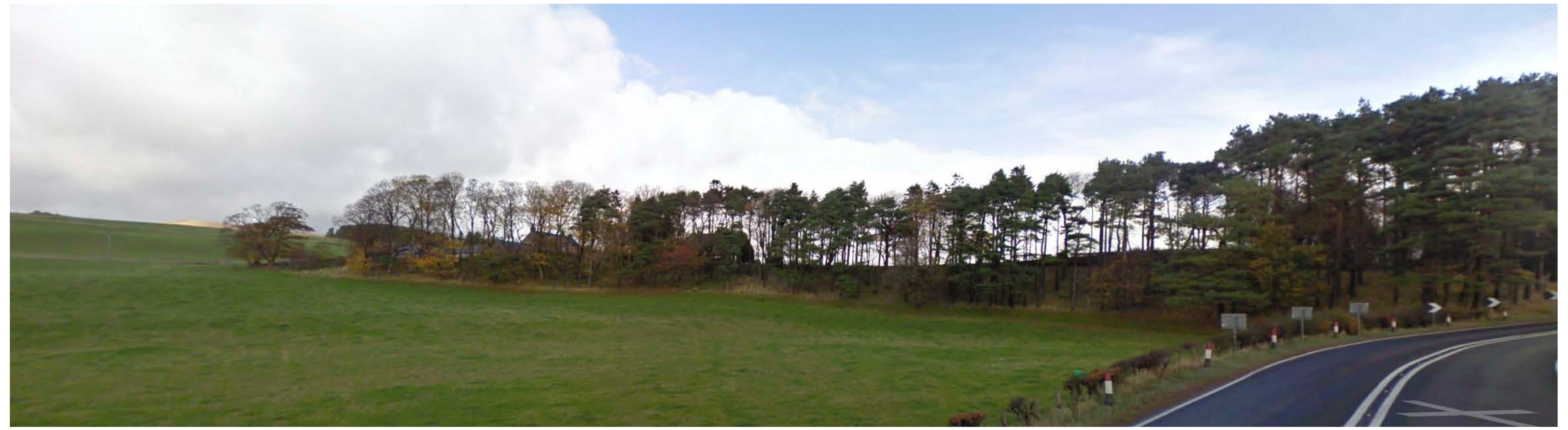
Property 19: Properties at Hazelside Farm and Property 20: Hazelside - View north east towards the properties, site located north west. These properties will have a view of all 14 turbines in some form or another. Due to the wooded surroundings the views will be screened to a certain extent.

Residential Amenity Study - Photographic Record