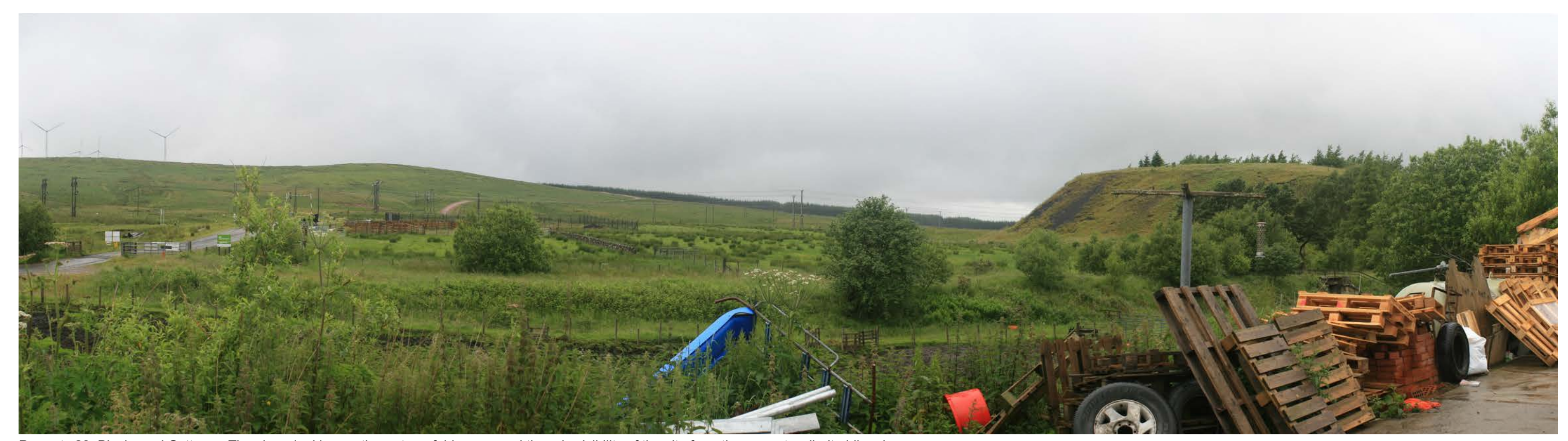
Property 23: Blackwood Cottage - The views looking north west are fairly open and there is visibility of the site from the property, albeit obliquely.