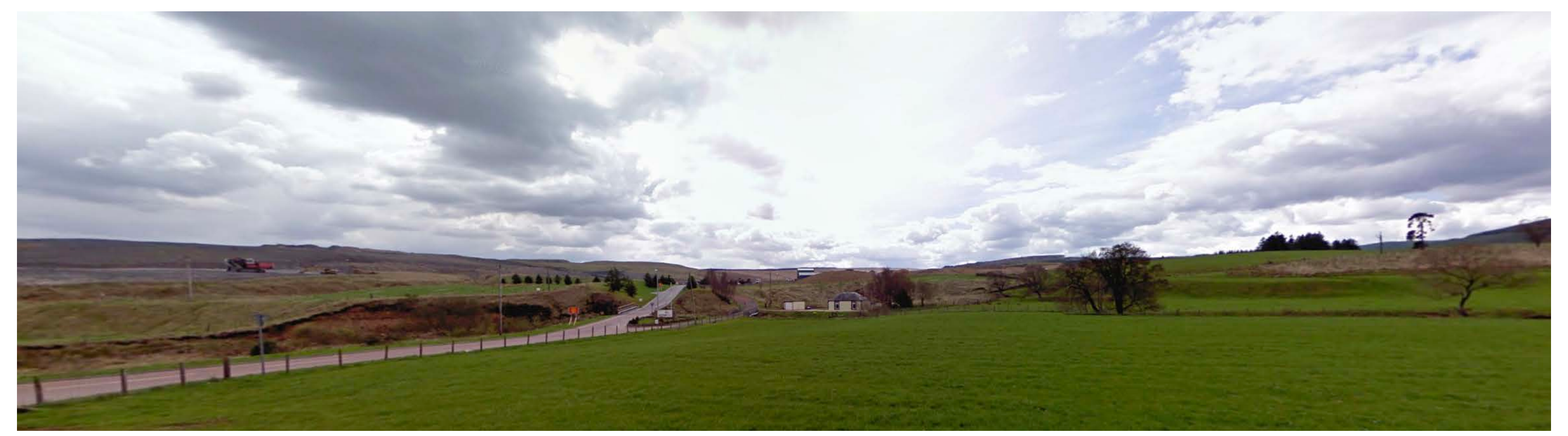
Property 11: Bungalow Cottage - View from the A70 southwards. The tubine site is located on the opposite side of the A70, northwards. From Bungalow Cottage there would be minimal visibility with only the top of the tips of the windturbines being visible.