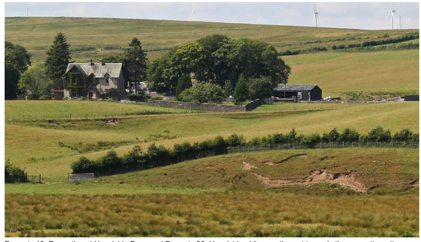
Property 19: Properties at Hazelside Farm and Property 20: Hazelside - View north west towards the properties, site located north west. These properties will have a view of all 14 turbines in some form or another. Due to the wooded surroundings the views will be screened to a certain extent.