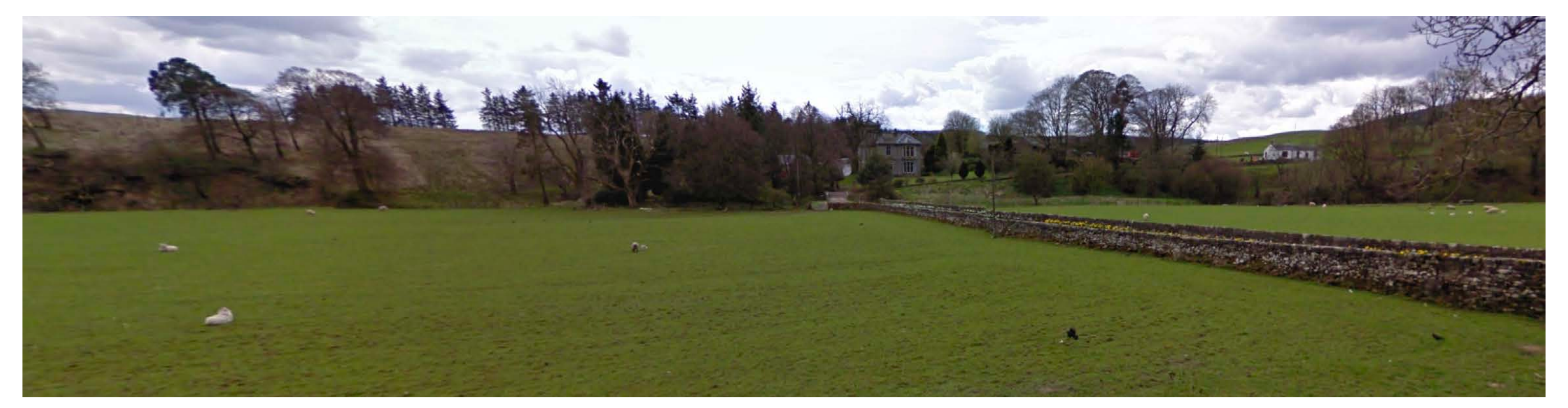
Property 8: Carmacoup Farm Cottage to the right and property 9: Carmacoup Farm to the left - View from the A70 looking south, houses would look out towards the turbines (northwards from the A70). The turbine site lies to the opposite side of the A70 and would be partially visible behind Longhouse Hill.